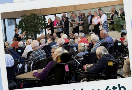
Sunday, May 4th